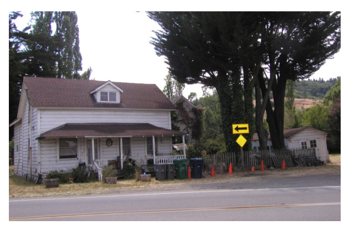
The Dinsmore Nicasio Home